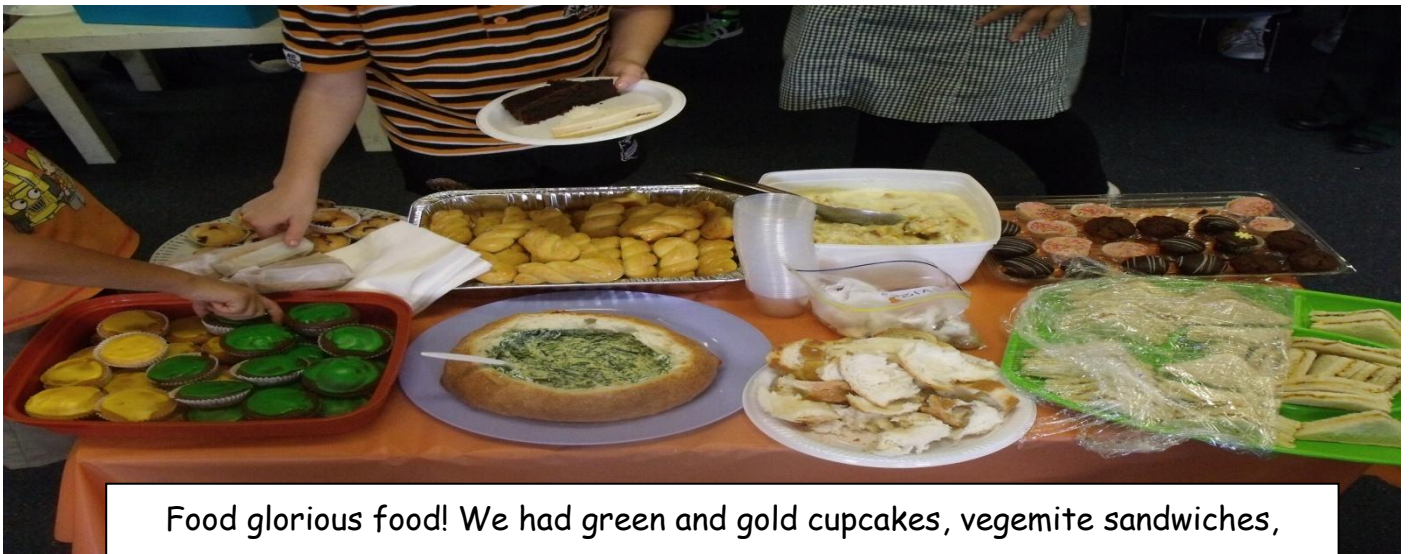
Food glorious food! We had green and gold cupcakes, vegemite sandwiches, trifle, cob & dip, mudcake, Greek biscuits and lamingtons. Most of the students tried something new and others found new food to love.