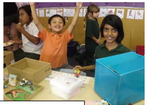
Just hanging out with our friends being kids!